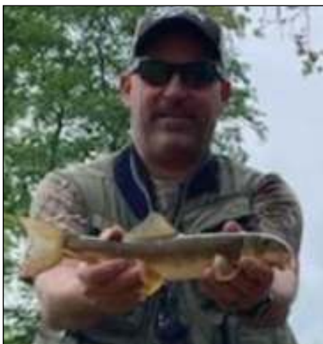
Sucker Shanan Poe Size: 16" / 1.2lbs Bait: Nightcrawlers Method: Stream fishing Dallastown, PA 05/20/2023