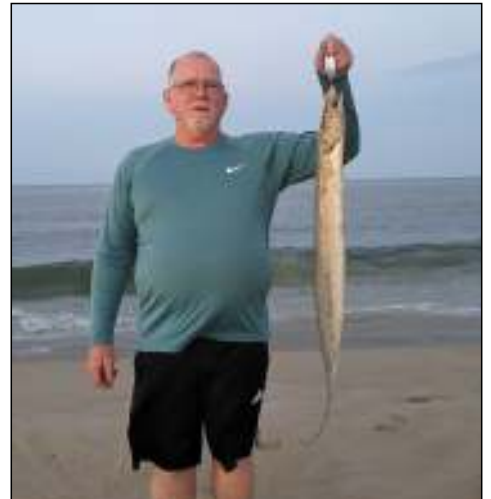
Ribbon Fish Melvin Jones Size: 36" / 4lbs Ocean View, DE Bait: Hopkins Lure 07/31/2023 Method: Surf fish