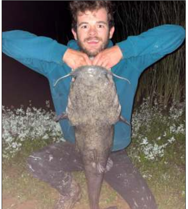
Flathead Catfish Size: 44" / 30lbs Bait: Bluegill Method: Bank Fishing