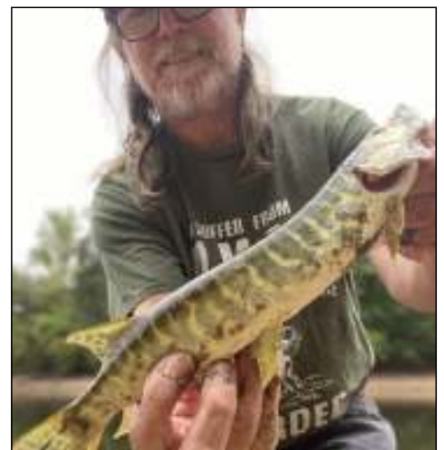
Northern Pike Bait: Spinnerbait Method: Bank Fishing