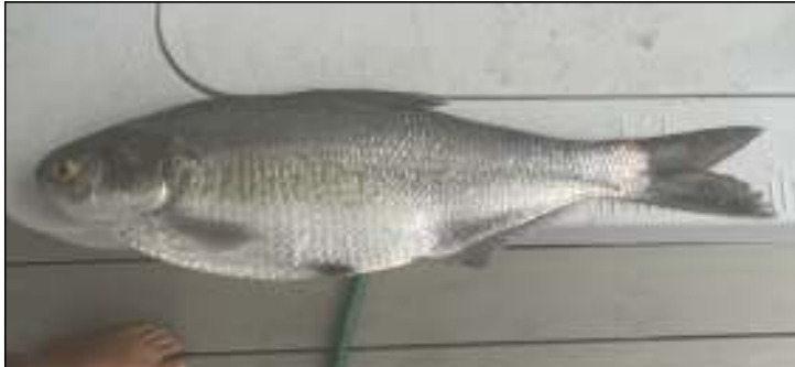
Gizzard Shad Size: 13" / 2.5lbs Bait: Net Method: Net