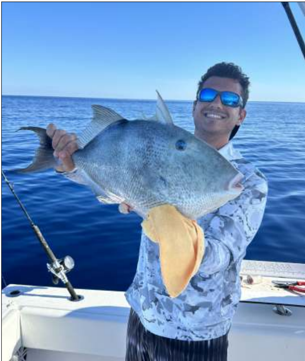
Triggerfish Size: 9lbs Bait: Squid Method: Boat Fishing