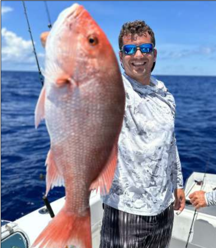
American Red Snapper Size: 28" Bait: Squid Method: Boat Fishing