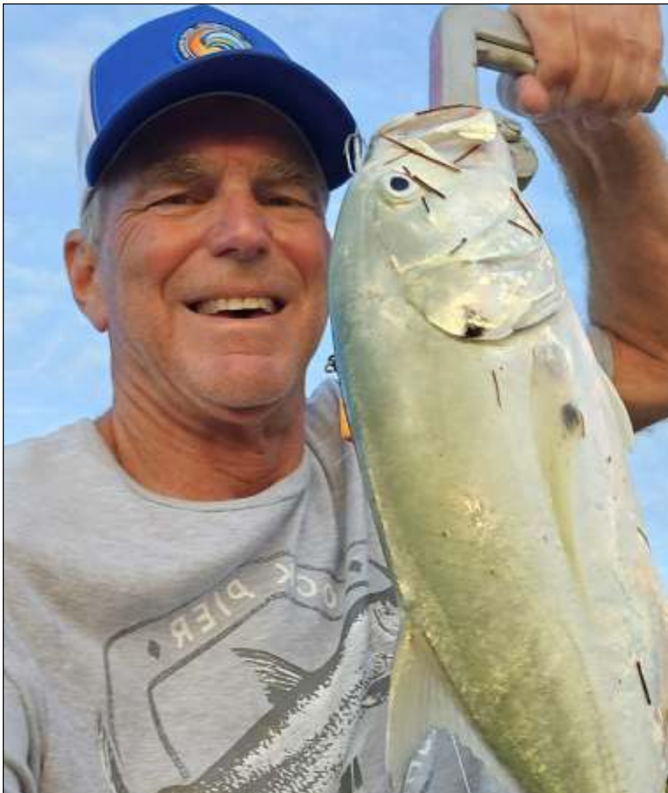
Crevalle Jack Size: 20" / 5.5lbs Bait: Popper Method: Bank Fishing