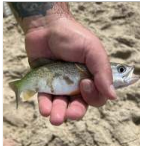
Spotted Seatrout Joe Tomaselli Size: 7" 08/27/2023 Bait: Sand Flea Method: Bottom Fishing