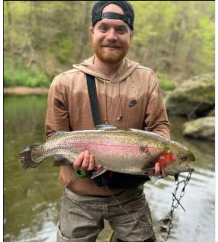
Rainbow Trout Size: 25.9" / 7.11lbs Bait: Spinner