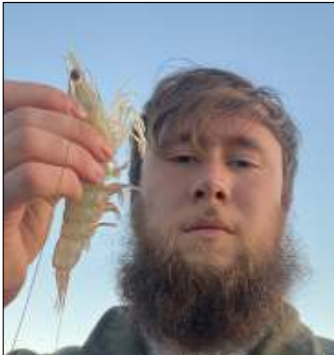
Shrimp Tyler Kramer Size: 6.5" Ludowici, GA Bait: Cast Net 02/04/2023 Method: Pier Fishing