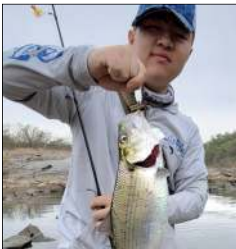
Shad Size: 17" / 2lbs Bait: Shad Dart Method: Bridge fishing