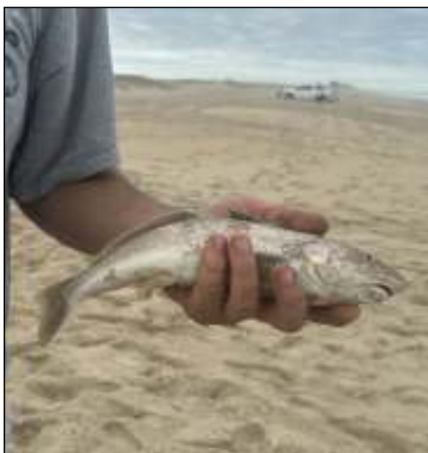
Kingfish Chris Connolly Size: 13" / 2lbs Millville, DE Bait: Fishbites 10/05/2023 Method: Surf Fishing