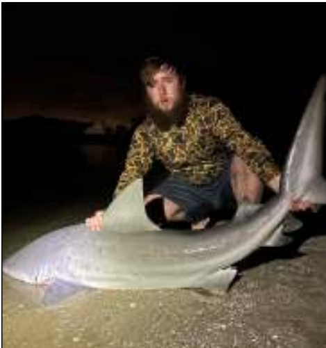
Bull Shark Size: 70" / 101.4lbs Bait: Stingray Method: Beach