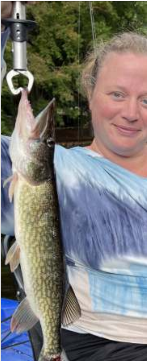
Chain Pickerel Size: 28" Bait: Artificial Worm Method: Kayak