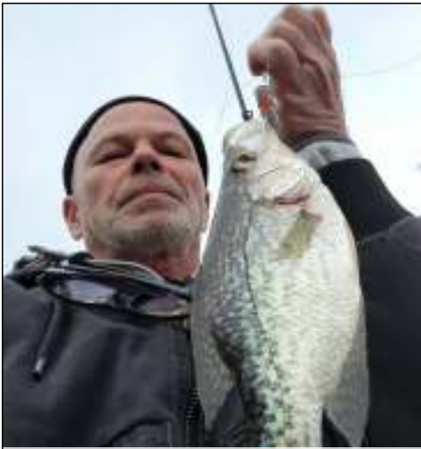
Crappie Thomas M Pollock Size: 10" / 0.5lbs Bridgeville, DE Bait: Crank Bait 11/15/2023 Method: Bank Fishing