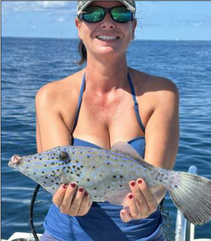
File Fish Bait: Shrimp Method: Boat Fishing