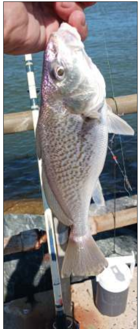
Croaker Size: 13" / 1lb Bait: Squid