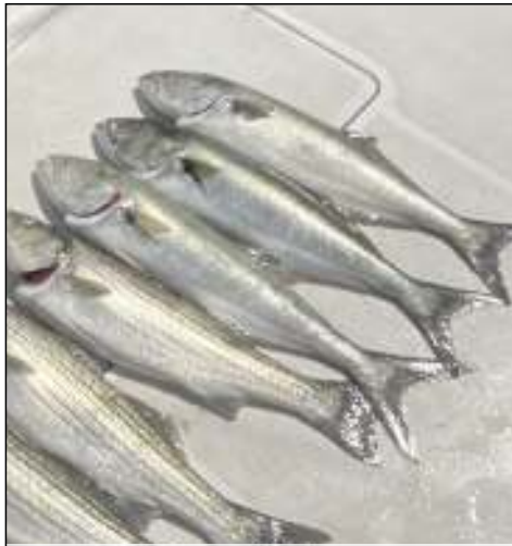
Bluefish Michael Culham Size: 37" Potomac, MD 3/8oz Chartreuse white Spinner 06/06/2023 Bait w/double Willow Painted Blades