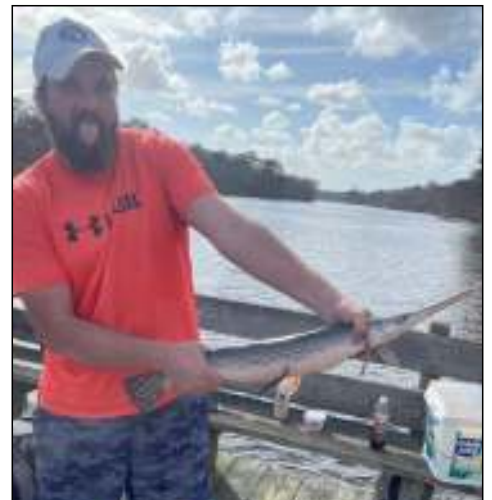
Longnose Gar Size: 29" / 5lbs Bait: Nightcrawlers Method: Pier Fishing