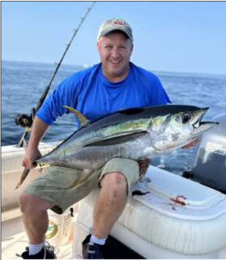
Yellowfin Tuna Size: 59lbs Bait: Trolling Squid