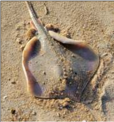
Stingray Ray Harper Size: 12" Lincoln, DE Bait: Bunker 05/14/2023 Method: Surf fish