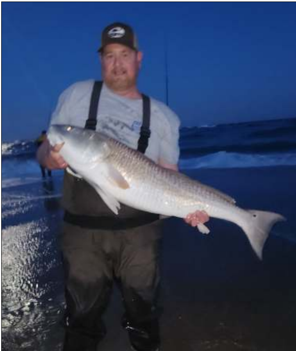
Red Drum Size: 40" Bait: Mullet Chunk Method: Surf Fishing