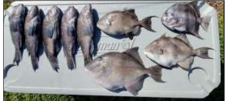
Triggerfish, Black Sea Bass, & Spadefish Cpt. Terry Murray Size: 21.5" / 4.1lbs Bait: Sand Fleas Method: Boat Fishing Frankford, DE 09/10/2023