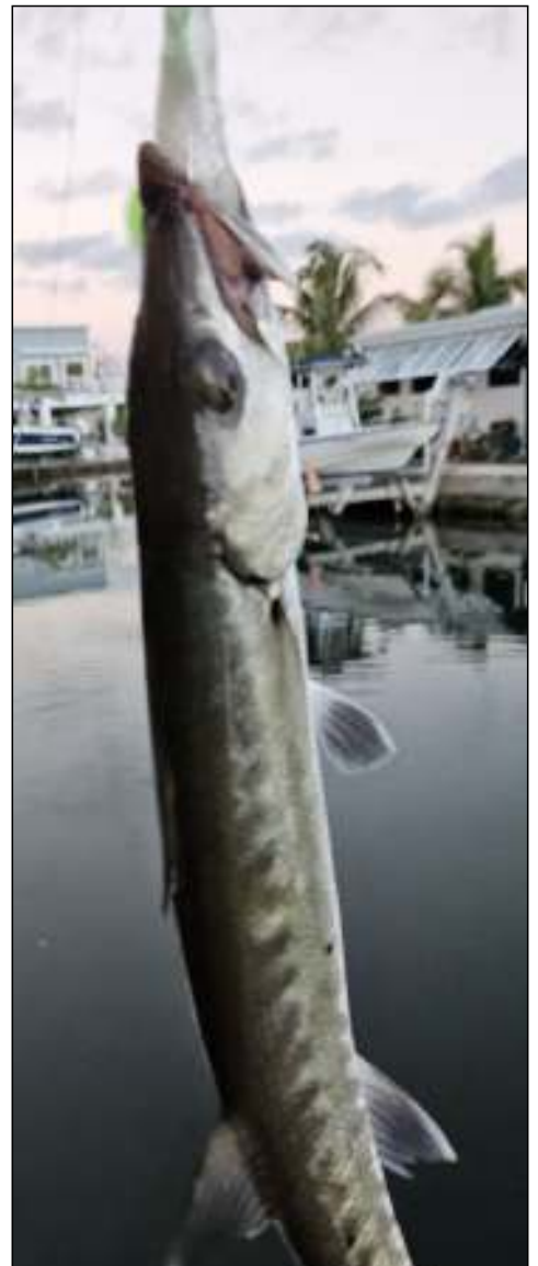
Barracuda Chic Stearrett Size: 16" / 2lbs Bait: Jig With Shad Tail Method: Backyard fishing 03/02/2023