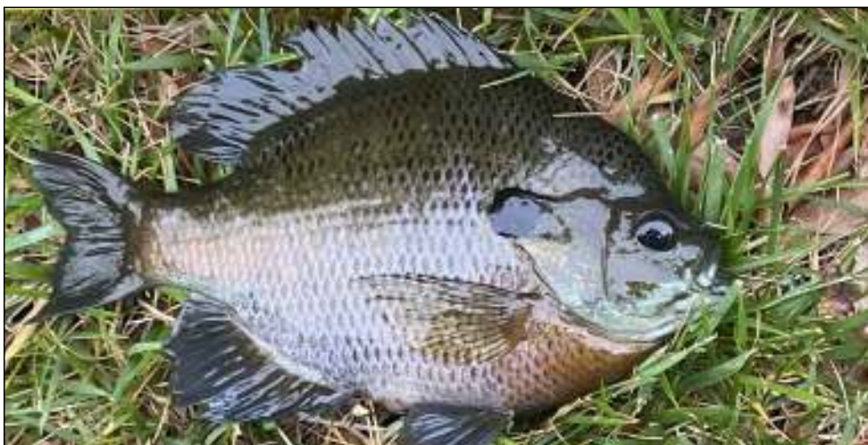
Pumpkinseed Size: 9" / 12lbs Bait: Gulp Method: Casting