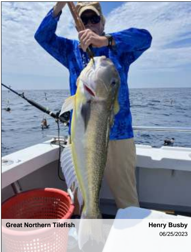
Great Northern Tilefish