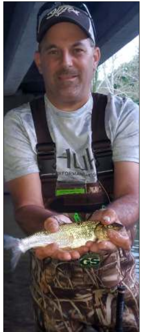
Fallfish Size: 10" / 3lbs Bait: Wax Worms Method: Stream fishing