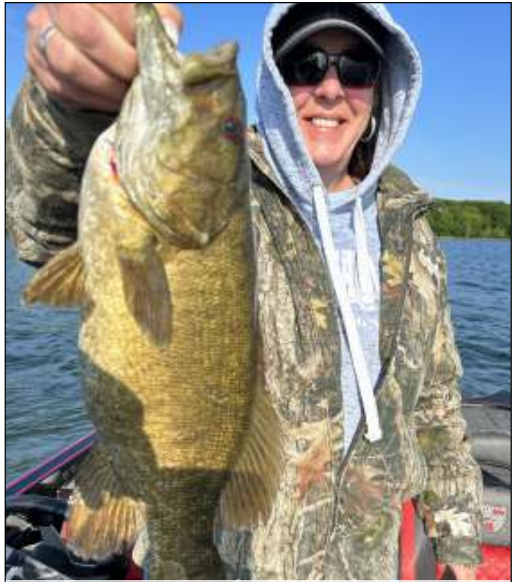
Smallmouth Bass Size: 4.2lbs