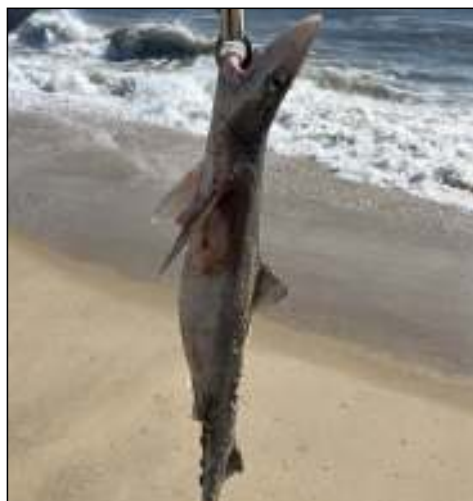
Spiny Dogfish Jeff Kirby Size: 36" Bait: Mullet Rig Method: Surf Fishing Rehoboth Beach, DE 04/23/2023