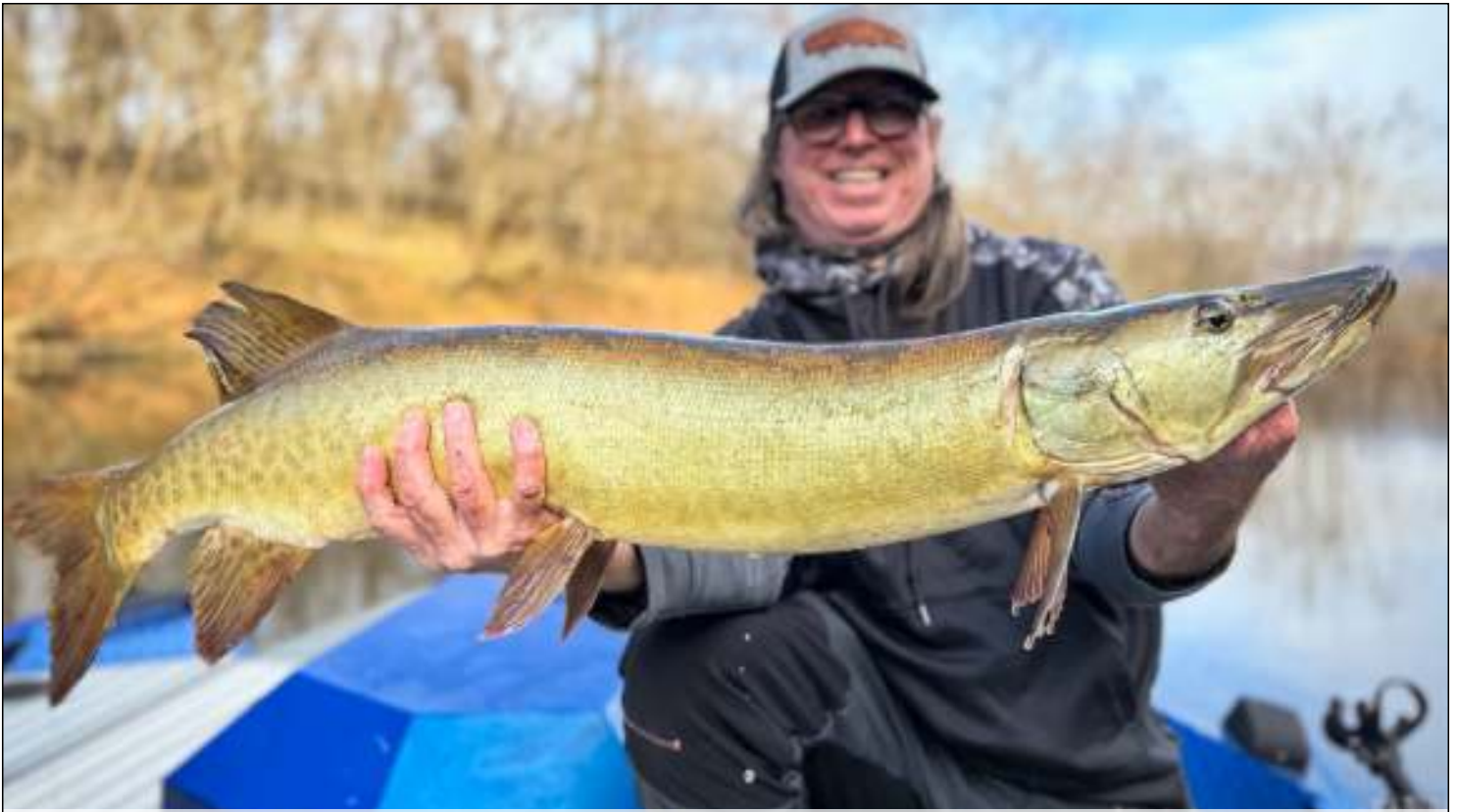
Muskie Size: 41" Bait: Jitterbug Taking a break from his bow on the James River