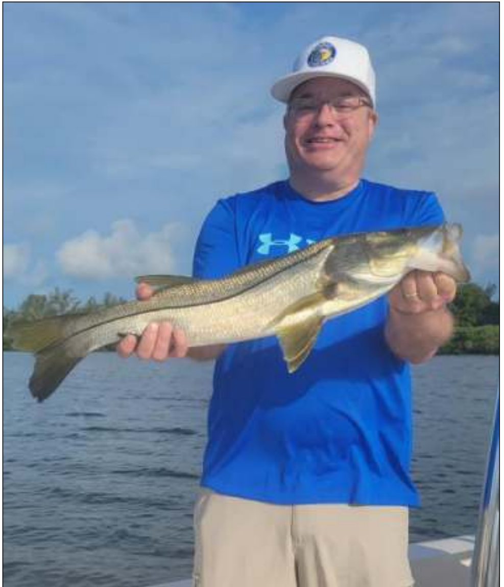
Snook Size: 28" Bait: Mullet Method: Casting