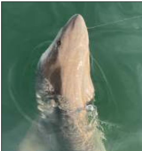
Sand Tiger Cooper Sargent Size: 132" / 300lbs Williamsport, PA Bait: Tuna 08/03/2023 Method: Boat Fishing