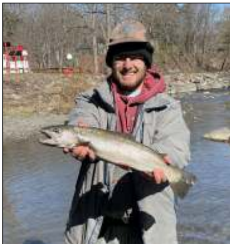
Steelhead Size: 25"