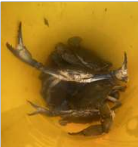
Blue Claw Crab Cooper Sargent Size: 8" / 1lb Williamsport, PA Bait: Chicken 08/01/2023 Method: Crab pots