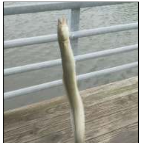
American Eel Size: 25" / 2lbs Bait: Hot Dog Method: Dock