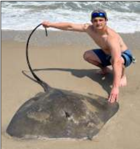
Rough tail Stingray C Villanueva Bait: Bunker 05/22/2023 Method: Surf Fishing