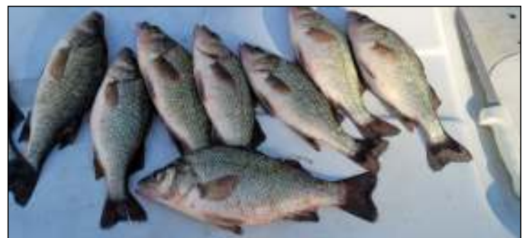
White Perch Size: 12.5" / 1.1lbs Bait: 1/4 Ounce Jig With Tubes and Grass Shrimp Method: Boat Fishing